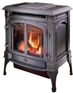
The small cast iron rear vent Sturbridge™

Lopi offers 3 distinct models to choose from: