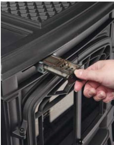
Pull-out Aromatherapy Tray and fill with your choice of essential oils.