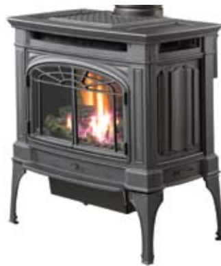
The large cast iron, top vent Berkshire™