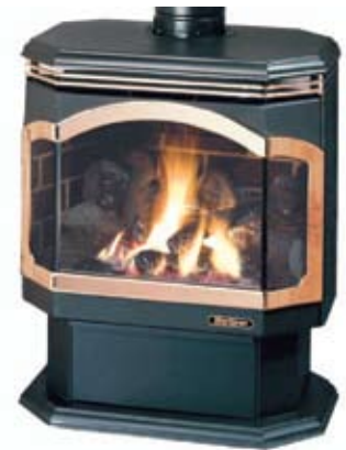
The large steel, top vent Heritage™